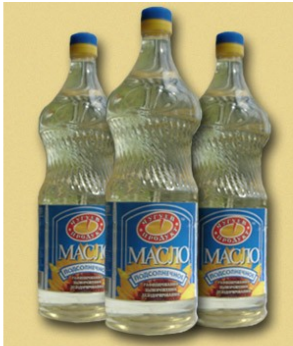
Sunflower oil GOST 1129-93