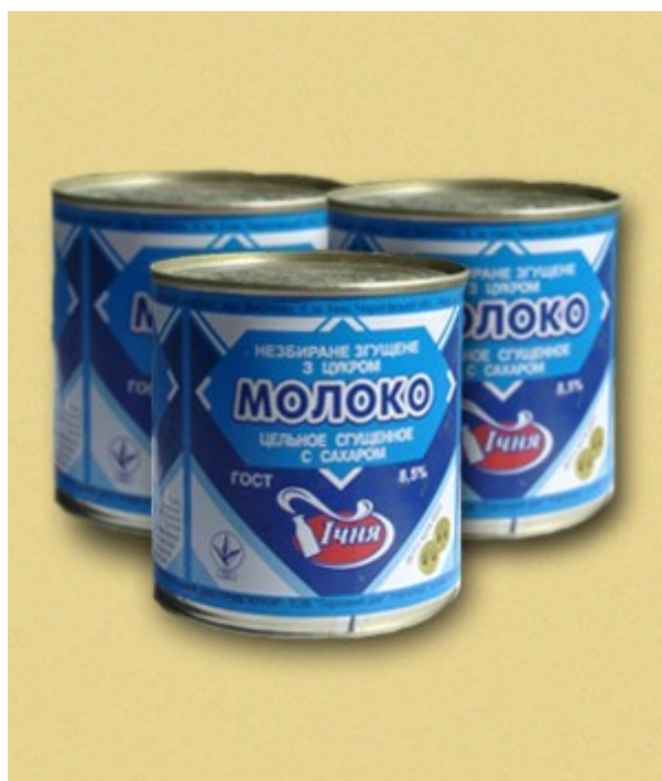
Condensed whole milk with sugar GOST 2903-78