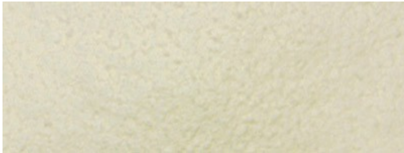
Skimmed milk powder GSTU 4273:2003